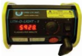
The above LOL-5 model displays a value of 5928 flashes / minute

Our latest redesign of our powerful handheld or fixed mounted LOL-5 includes built-in intensity controls allowing the operator to toggle between two modes by pressing on the Rotary Dial. The two modes, Flash Rate and Intensity, allow complete control of both flash rate (0 to 6000 f/min) and brightness (35 to 100%).