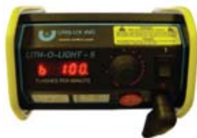
The above LOL-5 model displays a brightness value of 100%